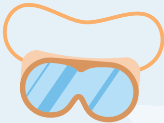
3. Face Shield/Goggles