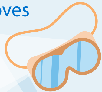
2. Face Shield/Goggles