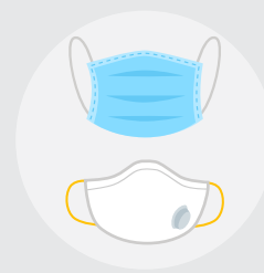
Remove Mask or Respirator