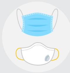
Put on Mask or Respirator