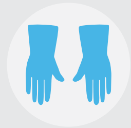
Put on Gloves