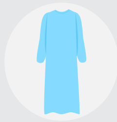
Put on Gown