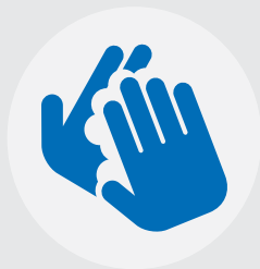
Perform Hand Hygiene