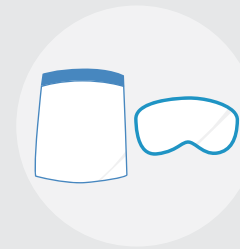
Put on Goggles or Faceshield